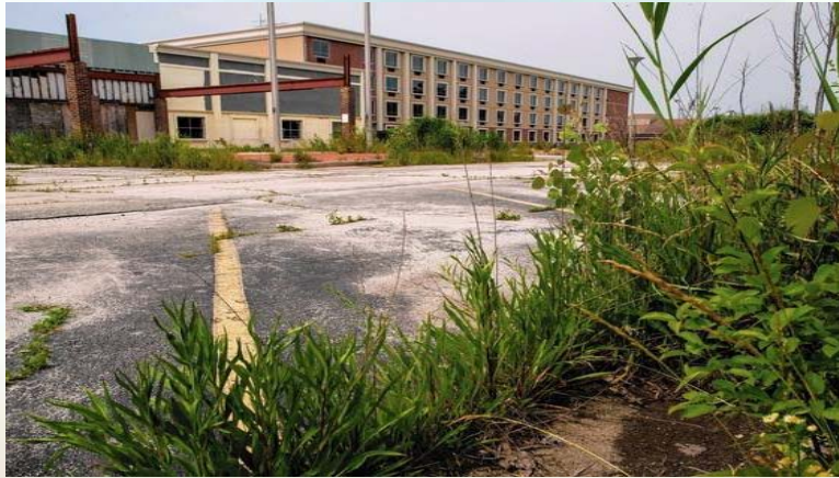
Harvey Regional Conference Center