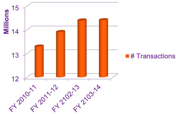
Electronic Funds Transfer Volume